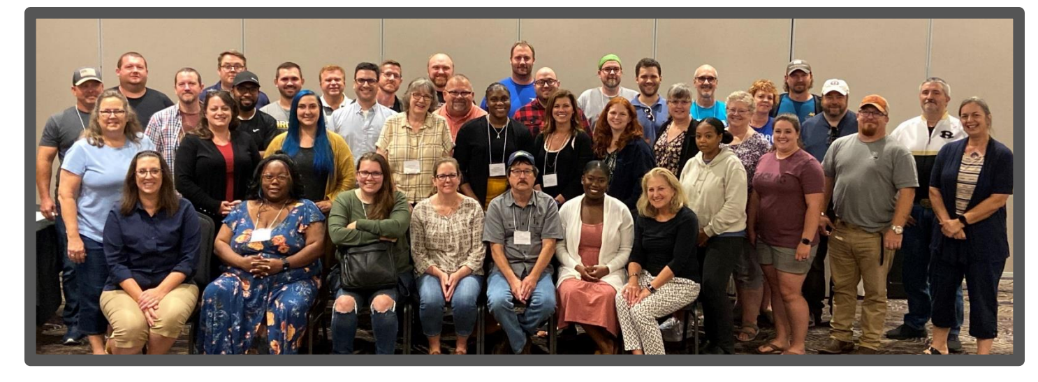
CTE New Teacher Institute Class of 2022

CTE New Teacher Institute Farmville, Virginia